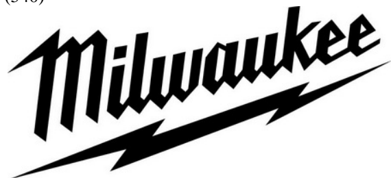
(591) Black, white